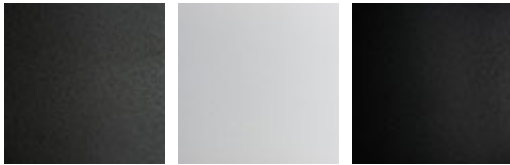
GFM69 graphite embossed