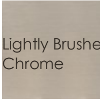
Lightly Brushed Chrome