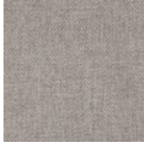
Body Fabric: 2605-71CC