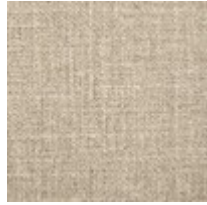
Pillow Fabric: 2- 22" x 22" and 1- 21" x 21" Pillow 2447-34CC