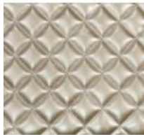
Fabric: 9085-75CC, 9085-75CC-Q