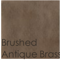
Brushed Antique Brass