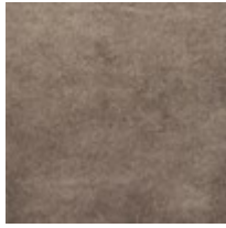
Pillow Fabric: 2- 20" x 20" Pillows 2569-92CC