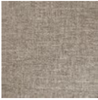
Body Fabric: 2570-93CC