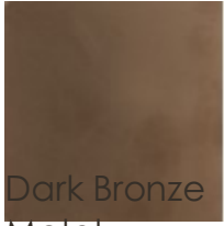
Dark Bronze Metal