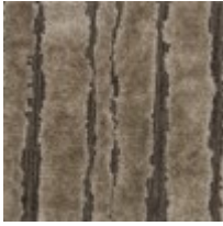
Body Fabric: 8260-18CC