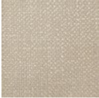
Body Fabric: 2585-71CC