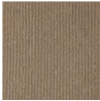
Body Fabric: Top Rail and Base 2652- 46CC, Seat Cushion 2654- 85CC