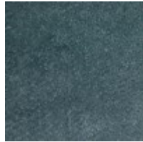
Pillow Fabric: 1- 20" x 20" Pillow 2285-52CC