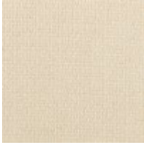
Body Fabric: 2490-34CC