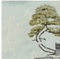
Body Fabric: 2694-88CC, Seat and Back Cushion 8330- 52CC