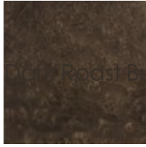
Dark Roast Burl