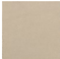
Boxed Back Cushion and Seat Cushion Seam Detail 3091-44CC