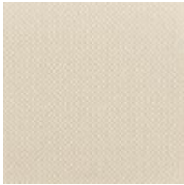
Body Fabric: 2461-34CC