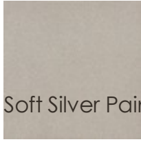
Soft Silver Paint