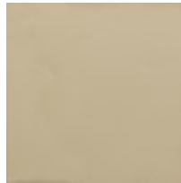
Whisper of Gold