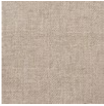
Body Fabric: 2573-71CC