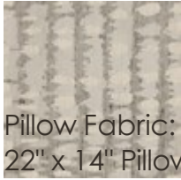
Pillow Fabric: 2- 22" x 14" Pillows 8273-71CC