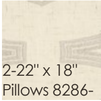
2-22" x 18" Pillows 8286- 89CC