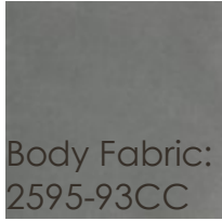
Body Fabric: 2595-93CC