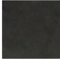
Pillow Fabric: 1- 19" x 19" Pillow 2565-55CC