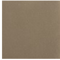
Pillow Fabric: 2- Roll Bolsters 2536-34CC