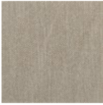
Body Fabric: 2493-71CC