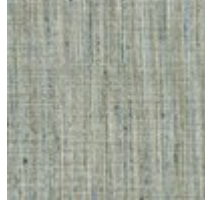
Pillow Fabric: 1- 17" x 17" Pillow 2703-52CC