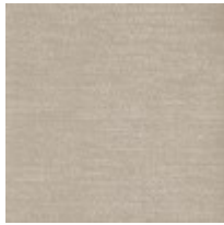
Body Fabric: Inside and Top Rail 2598-44CC, Outside and Bottom Rail 3173-35CC