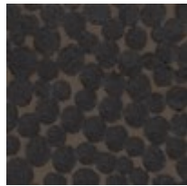
Pillow Fabric: 1- 18" x 18" Pillow 8275-91CC