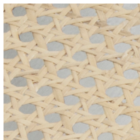
Natural French Rattan