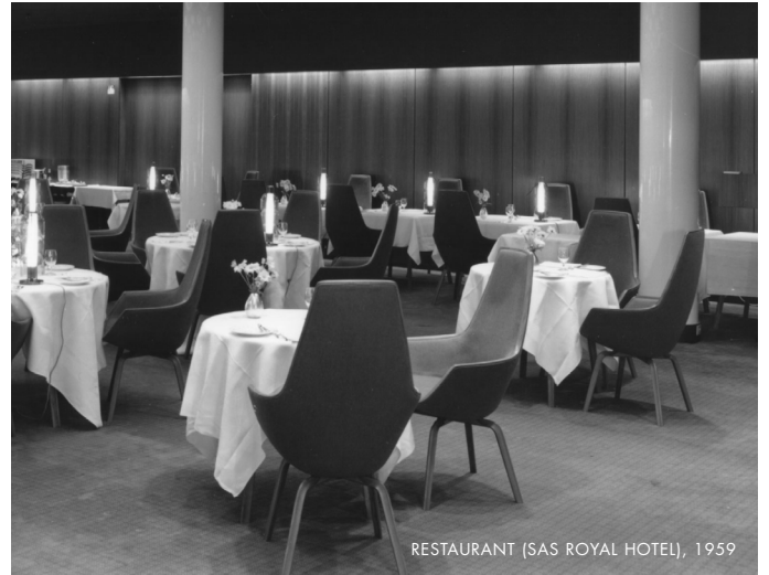
RESTAURANT (SAS ROYAL HOTEL), 1959

Arne Jacobsen was incredibly productive, both as architect and designer. At the end of the 1950s he designed the SAS Royal Hotel in Copenhagen, also designing the Egg™, the Swan™, the Swan Sofa™ and Series 3300™ for the same project.