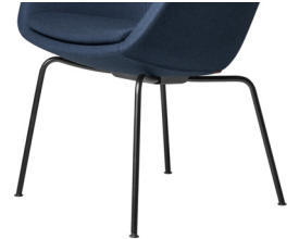
BLACK POWDER COATED