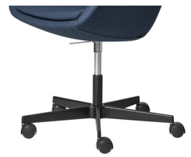
BLACK POWDER COATED ALUMINIUM