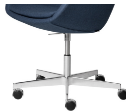
SATIN POLISHED ALUMINIUM