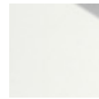
White hpl white core