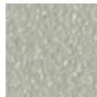
Light Grey Steel