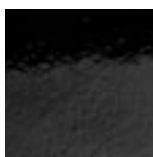
Metal black chrome.