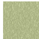
Sage Green Steel