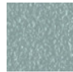
Light blue steel