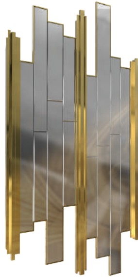
Empire | mirror